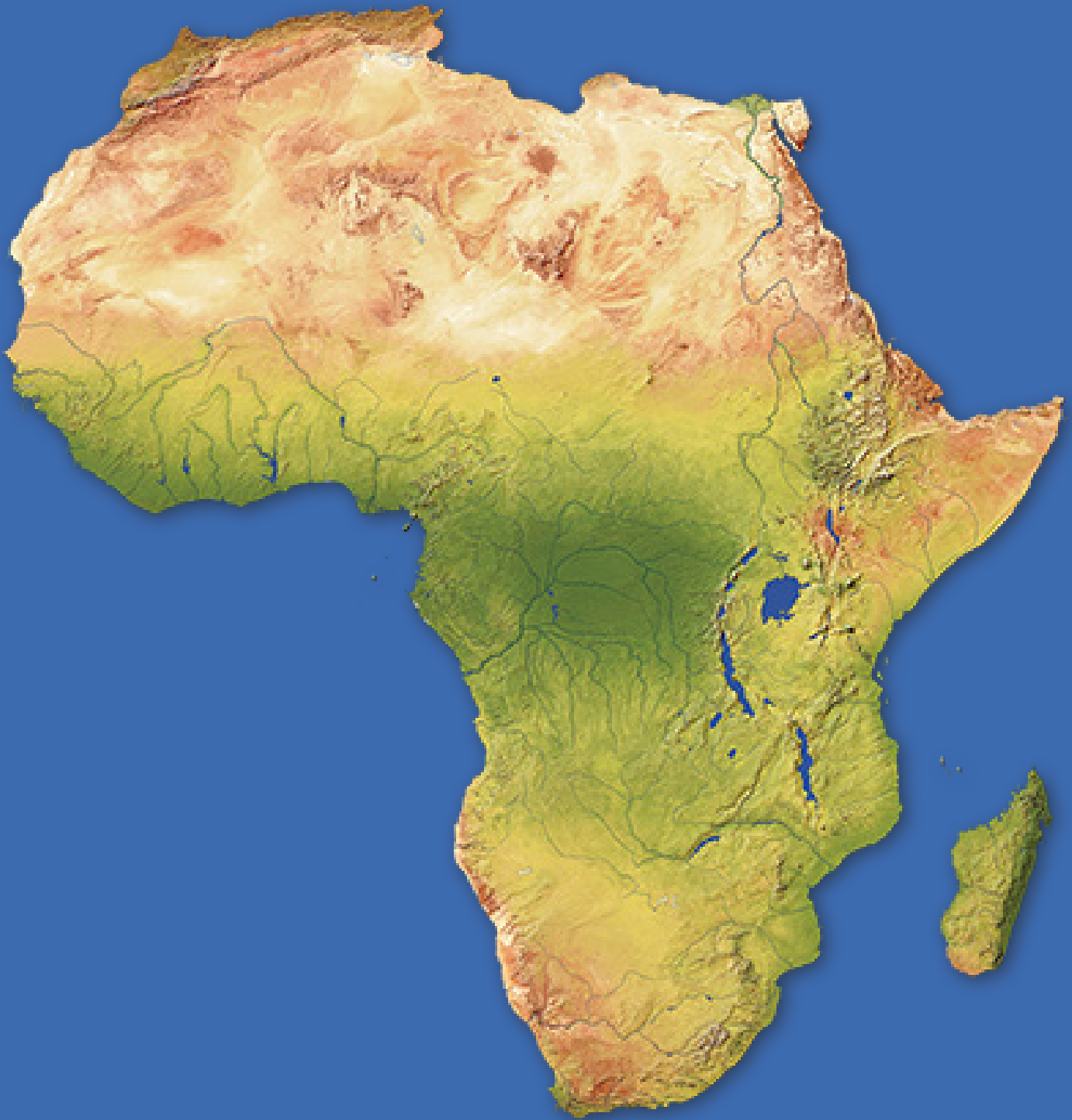
Figure 1 - OSS' area of action and member states.