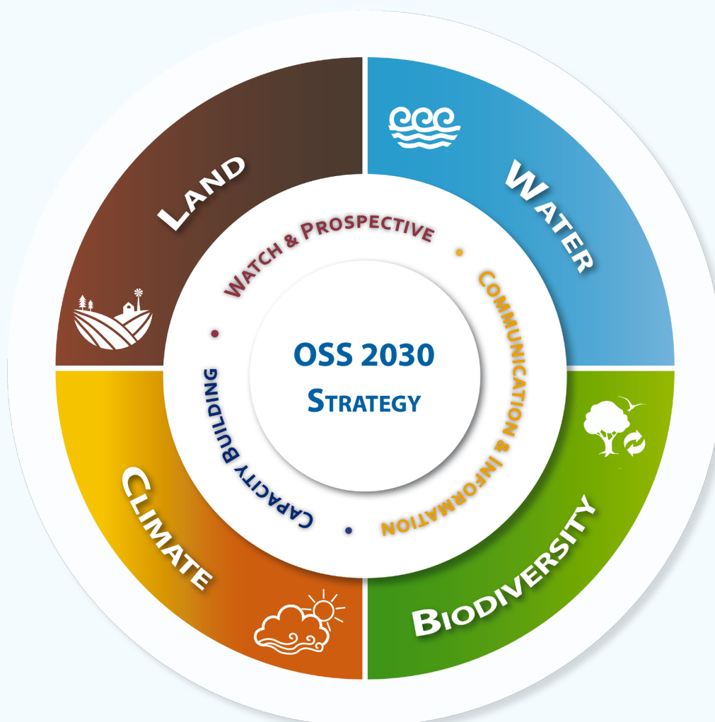
Scientific & Technical Axes of the OSS 2030 Strategy